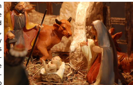
Antique Nativity figurines dating back to early 1900s.